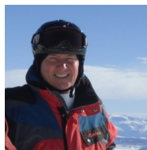
MOTY Nominee &amp; the FWSA Dinner